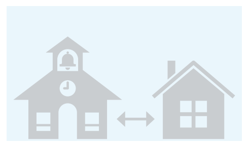
School-home communication that empowers families to be involved in their children's education